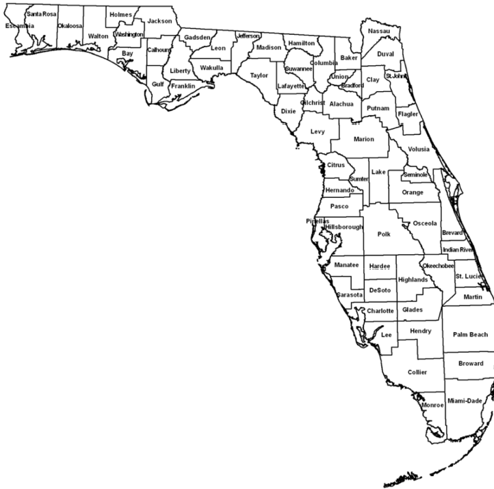
Figure 1 — Counties of Florida.

calculate property tax assessments, to obtain a statewide census of these pools. The opportunity to gather this information became available in summer 2006, when the Office of Injury Prevention employed a graduate public health student intern (K.H.) partially funded by the CDC grant to gather this information under the direction of the office's injury epidemiologist at the time (M.L.).